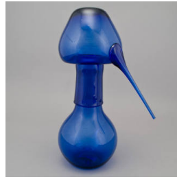
Title: Rosewater distiller Date: 2017 Primary Maker: Abou Mahmoud Medium: Glass