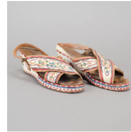
Title: Shoes Date: 1960s Primary Maker: Artist unrecorded Medium: Leather, silk or cotton, metal