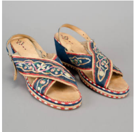
Title: Shoes Date: 1960s Primary Maker: Artist unrecorded Medium: Leather, cotton