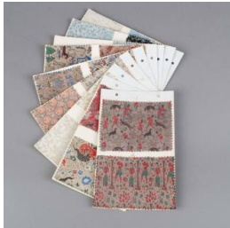
Title: Fabric Sample Medium: Silk, paper