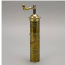
Title: Coffee Grinder Date: Early to mid-20th century Primary Maker: Artist unrecorded Medium: Brass