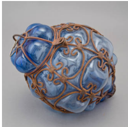
Title: Lantern Date: 2017 Primary Maker: Abou Mahmoud Medium: Glass, metal (iron)