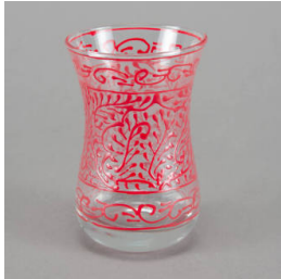
Title: Tea glass Date: 2017 Primary Maker: Abou Mahmoud Medium: Glass