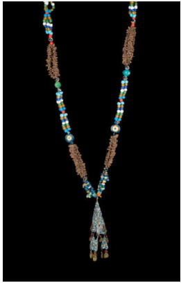
Title: Bridal necklace with amber and alum Date: c. 1900 Medium: Alum, gold-colored "coins," glass beads, cloves, wire, twine