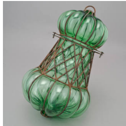
Title: Lantern Date: 2017 Primary Maker: Abou Mahmoud Medium: Glass, metal (iron)