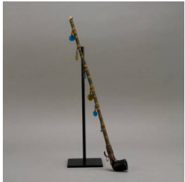
Title: Pipe Date: Early 20th century Medium: Wood, reed, brass, beads, leather