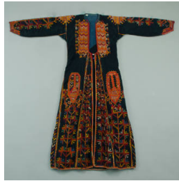
Title: Woman's Coat Date: late 19th- early 20th century Medium: Indigo dyed cotton, silk, glass buttons; balanced plain weave