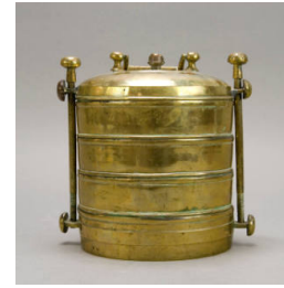
Title: Tiffin Carrier / Food Container Date: Early to Mid 20th century Primary Maker: Artist unrecorded Medium: Brass