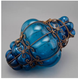
Title: Lantern Date: 2017 Primary Maker: Abou Mahmoud Medium: Glass, metal (iron)