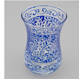
Title: Tea glass Date: 2017 Primary Maker: Abou Mahmoud Medium: Glass