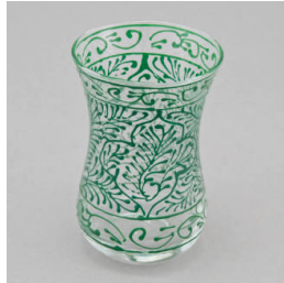
Title: Tea glass Date: 2017 Primary Maker: Abou Mahmoud Medium: Glass