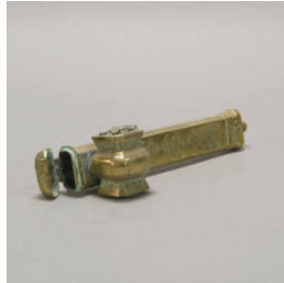
Title: Scribe's pen and ink case Date: Late 19th - early 20th century Primary Maker: Artist unrecorded Medium: Brass