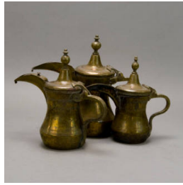
Title: Coffee Pots Date: ca. 1930 or before Medium: brass