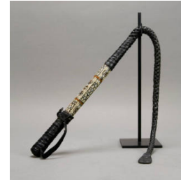
Title: Camel Whip Date: Mid-20th century Primary Maker: Artist unrecorded Medium: Leather, bone, varieties of wood, mother-of-pearl, metal