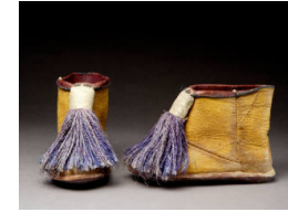
Title: Shoes Medium: Leather, metal wrapped thread, fiber