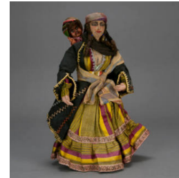
Title: Doll Date: c. 1970 Primary Maker: Artist unrecorded Medium: Cloth, paint, plastic