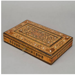
Title: Box with key Date: First Half of 20th Century Primary Maker: Artist unrecorded Medium: Wood, mother of pearl, brass, fabric