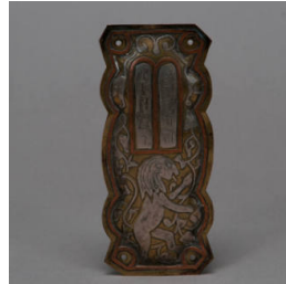
Title: Mezuzah case Date: 20th century Medium: Brass, silver, copper