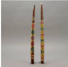
Title: Candle Date: ca 1960, staff Primary Maker: Artist unrecorded Medium: Organic, paper, fiber