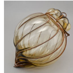
Title: Lantern Date: 2017 Primary Maker: Abou Mahmoud Medium: Glass, metal (iron)