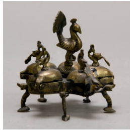
Title: Cosmetic container