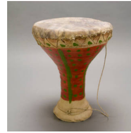
Title: Drum Date: Circa 1958 Primary Maker: Artist unrecorded Medium: Ceramic, paint, hide