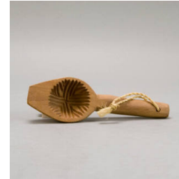
Title: Ma'amoul (Cookie) Mold Date: Circa 1950 Primary Maker: Artist unrecorded Medium: WOOD, FIBER