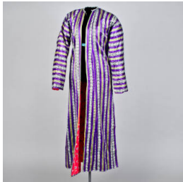
Title: Coat Date: Circa 1970 Medium: Silk, wool, metallic