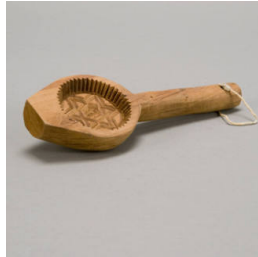
Title: Ma'amoul (Cookie) Mold Date: ca. 1960 Primary Maker: Artist unrecorded Medium: wood