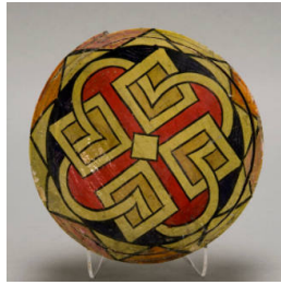
Title: Round, painted box Date: ca 1958 Primary Maker: Artist unrecorded Medium: wood, paint, adhesive