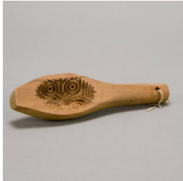
Title: Ma'amoul (Cookie) Mold Date: Circa 1960 Primary Maker: Artist unrecorded Medium: wood