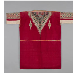
Title: aba Date: 19th century Primary Maker: Artist unrecorded Medium: Silk and wool, metallic yarns, lined with printed cloth