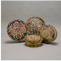
Title: Round, painted box Date: ca. 1959 Primary Maker: Artist unrecorded Medium: Wood, paint