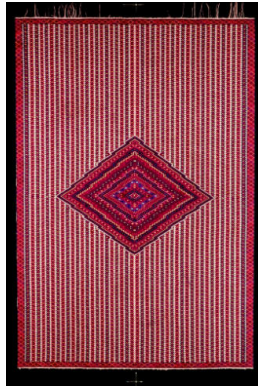
Title: Serape Date: 1750 - 1800 Primary Maker: Artist unrecorded Medium: Wool, cotton